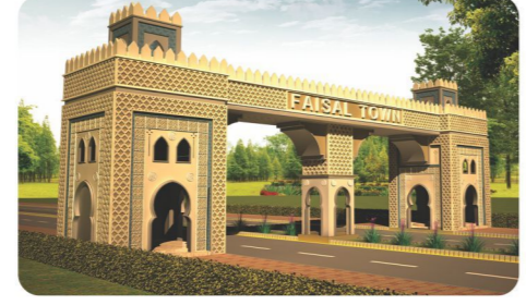
Main Gate FAISAL TOWN

Phase-1 Located on Main Fateh Jang Road. - N-80 Rawalpindi — Block A, B and C